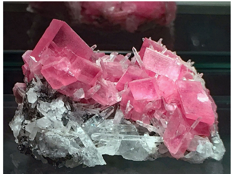
Rhodochrosite, Sweet Home Mine, Alma, Colorado