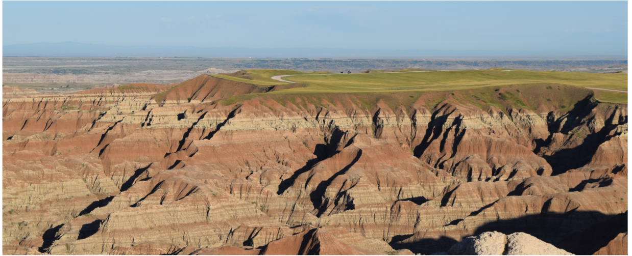
Badlands, South Dakota