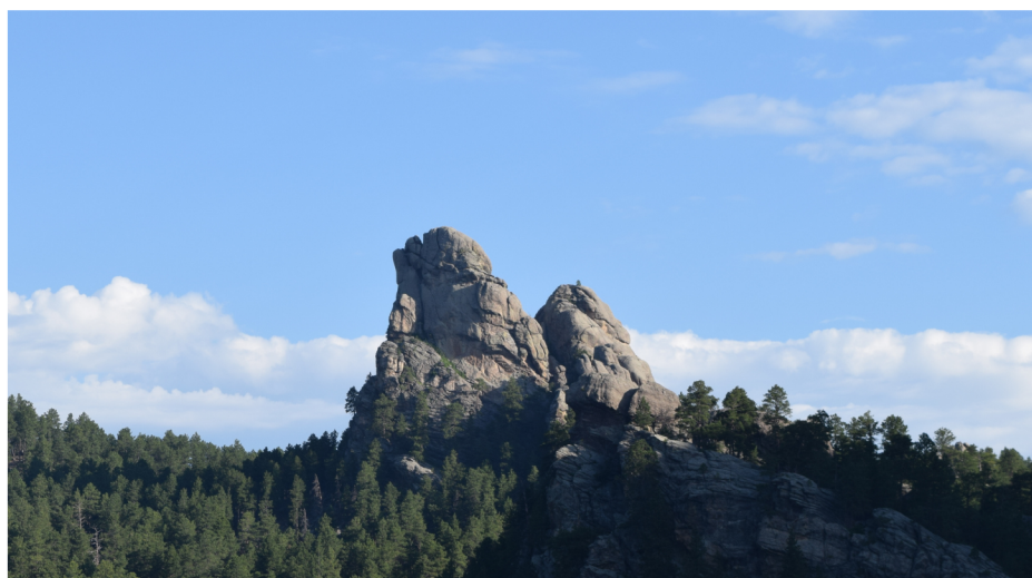
Black Hills, South Dakota