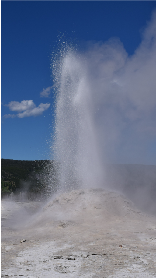
Geyser Yellowstone, Wyoming