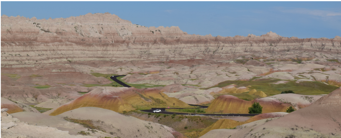
Yellow Mounds Badlands, South Dakota