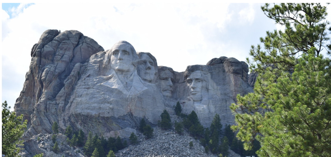
Mt. Rushmore Black Hills, South Dakota