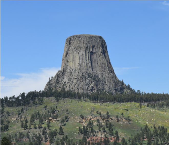
Devils Tower Wyoming