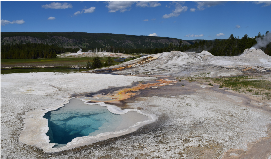
Hot Springs and Geyser Yellowstone, Wyoming