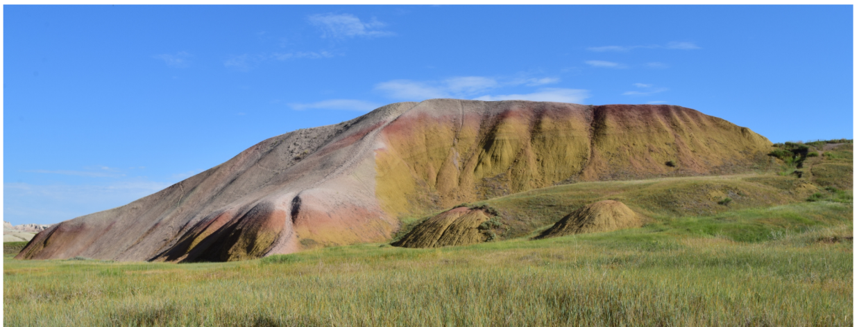
Yellow Mounds Badlands, South Dakota