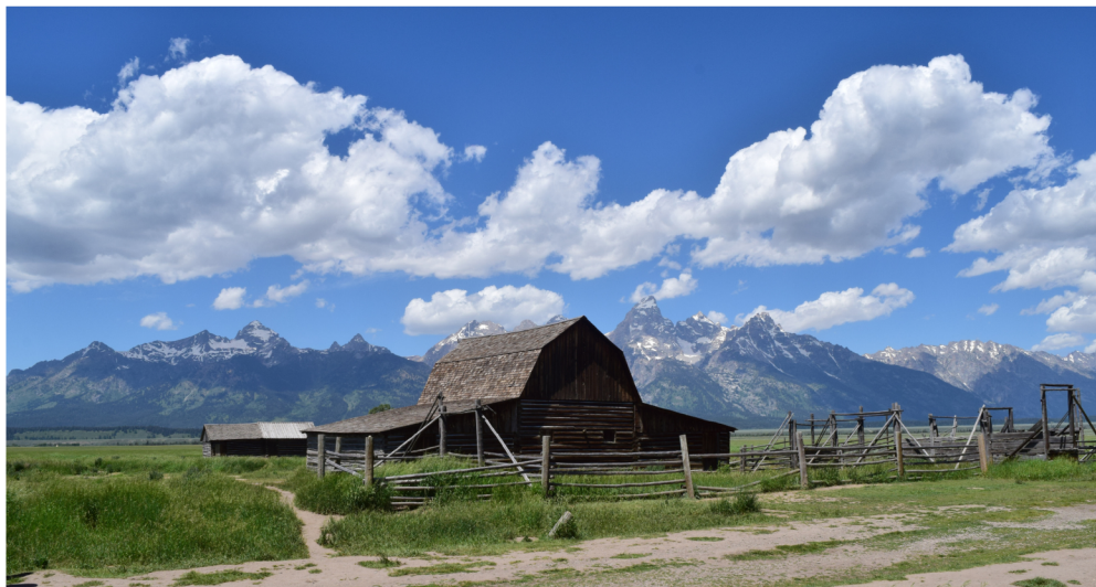
Grand Tetons Wyoming